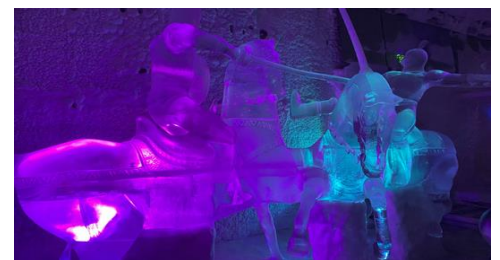
Life-Sized Dueling Knights Made of Ice

Some of the other places we visited were the Museum of the North (exhibits on Alaskan history and culture), Creamer's Field and the Migratory Waterfowl Refuge (lots of walking trails although we didn't see many birds because the migration was over), Chena Hot Springs, and the Aurora Ice Museum. The Ice Museum is kept at 25°F year-round. Everything in the Museum is made of ice, even the glasses where you can enjoy an appletini at the ice bar. For a unique experience there are rooms where you can spend the night on a bed made of ice.