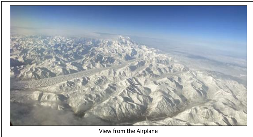
View from the Airplane

in South Korea for 8 months. We thank them for their service and for the sacrifices they and their families make.