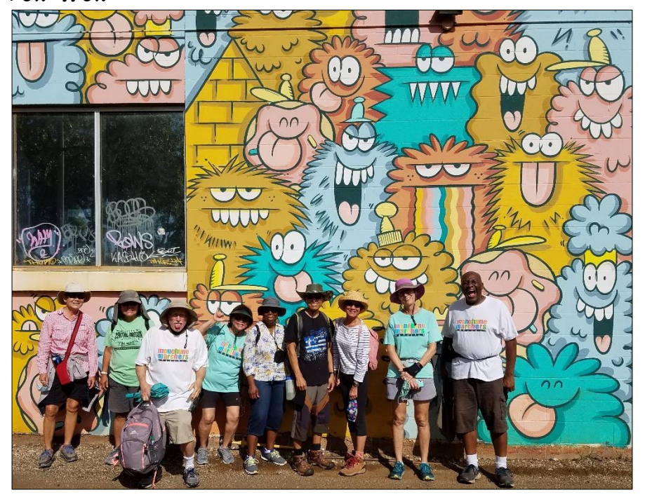
Manoa - March 12