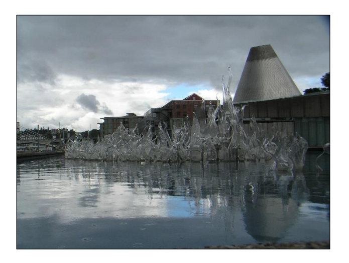
Tacoma Museum of Glass