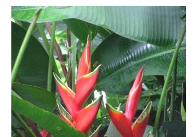
Ho'omaluhia