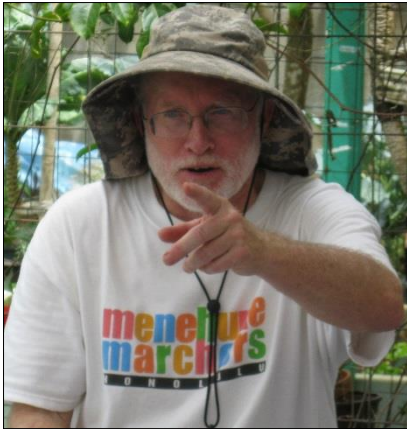
Maybe this way....