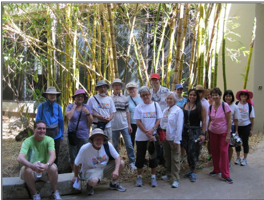
Peaceful Stop amid the Golden Bamboo in the University of Hawaii Art Building