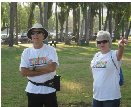
Maybe that way....