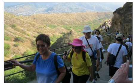
On the Trail