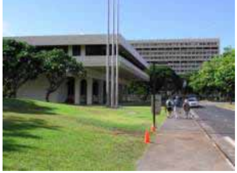
-Jefferson Hall-East West Center