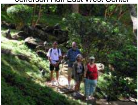
Japanese Garden-East West Center