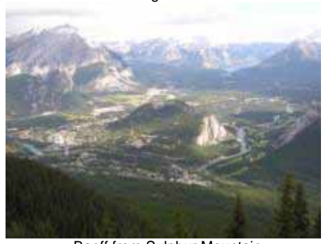
Banff from Sulphur Mountain