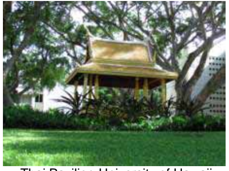
Thai Pavilion-University of Hawaii