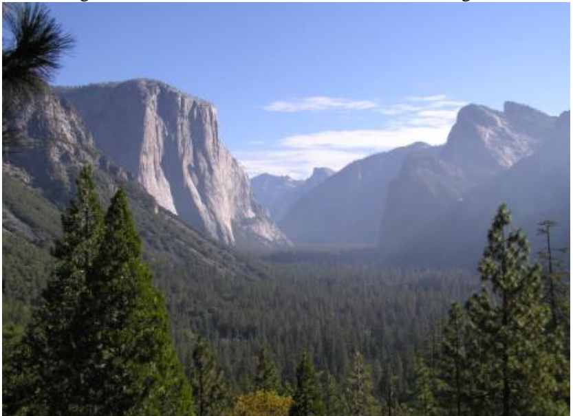
The major waterfalls were dry, because they are rain and glacier fed, rather than river, but the autumn colors were out, in abundance. Yellows, reds, and oranges among the dark greens. Mist and fog and coolness enveloped

In early October, we spent a few autumn days in the Sierra Nevada Mountains of California, in a small valley in Yosemite National Park. There was a very large rock called El Capitan, and another that looked like it was cut in half, called Half Dome. We did a Mist Trail walk under Half Dome, along the Merced River, which still had water flowing.