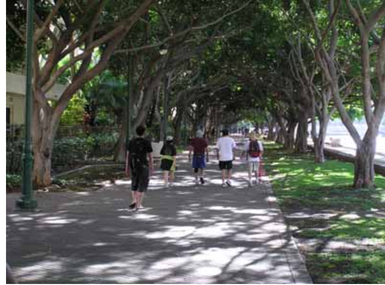
Mahalo to "Trail Master" Dennis Romig for wheeling the route and to all those who diligently read the map directions to check for clarity. The new maps will be made available as soon as the old ones are depleted.. Waikiki YR #166 will then have two 10K options.