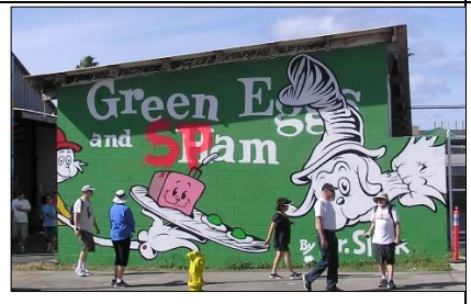
Pow Wow - Capitol