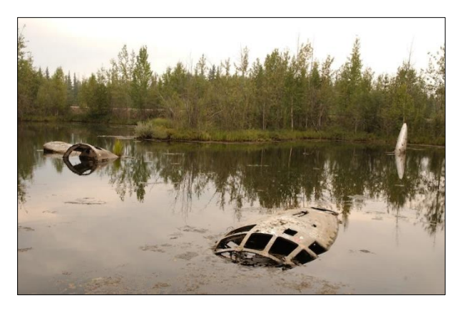
photo from the website. You can barely see part of the cockpit, tail and wing.

Coincidentally, on our flight home we sat next to a woman who had landed at Eielson AFB earlier that day. She was a flight attendant on a charter flight from South Korea, bringing back a plane full of troops. Flying on these charter flights can be a different experience. She told us that the passengers brought their (unloaded) weapons with them on the plane, and that some of them had problems trying to fit their rocket launchers in the overhead compartments. But the troops were obviously very excited to be going home after being