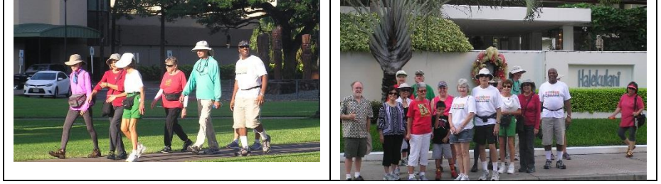
Christmas Walk and Party:

The above milestones are recapped from The American Wanderer , AVA's newsletter.