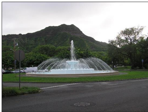
Diamond Head and the Dillingham Fountain as seen on the Kahala Walk

The Milestones were extracted from The American Wanderer , a bi-monthly publication of the American Volkssport Association. The American Wanderer is mailed free to all AVA members.