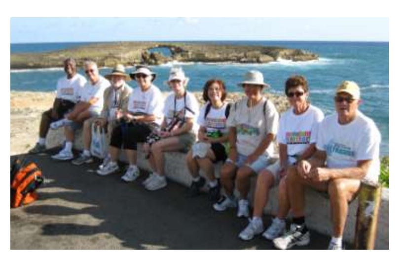
Laie Point with its fabulous view