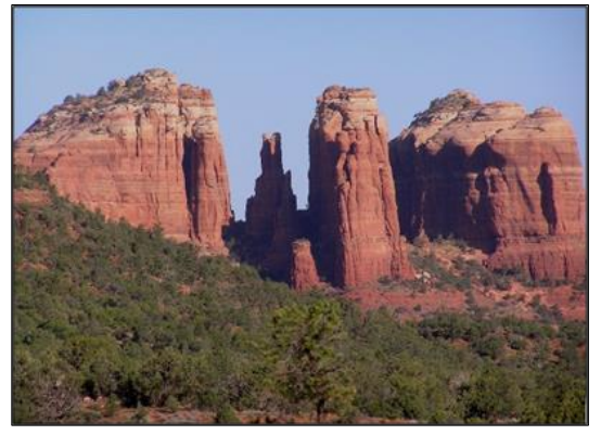
Courthouse Butte Loop

rock formations and colors as we walked Bell Rock Trail (sunset) and Courthouse Butte (early morning). An added plus - upon arrival at our hotel, we discovered that the registration/start point for the walk was just across the street.