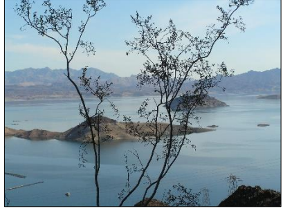
Lake Mead Railroad Tunnels Walk

Hope you are starting to venture out as and enjoying the many fun things here and off-island. See you on the trails!