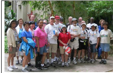
Menehunes outside the Art Building at UH