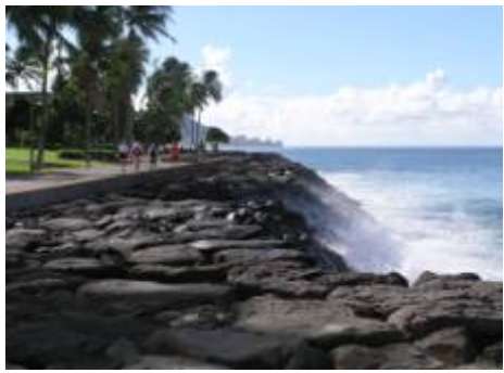
HON MENT--Kakaako Waterfront Park