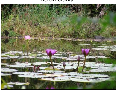
West Loch Walk