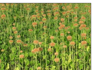
Diamond Head Walk