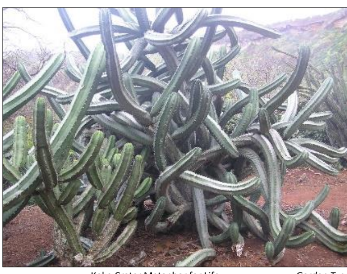
Koko Crater Metaphor for Life