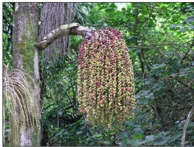
Koko Crater Botanical Garden