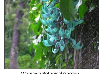
Wahiawa Botanical Garden