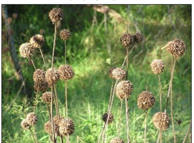
Diamond Head Walk