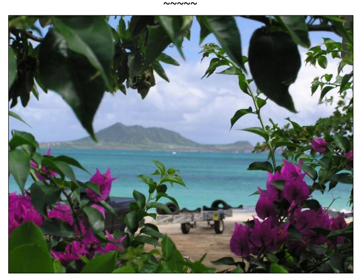
Floral Window to the Windward Side