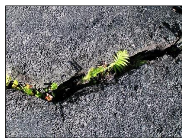
Volcano Floor - Volcano Walk