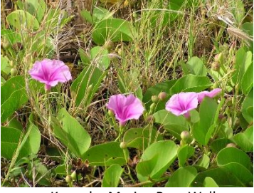
Kaneohe Marine Base Walk