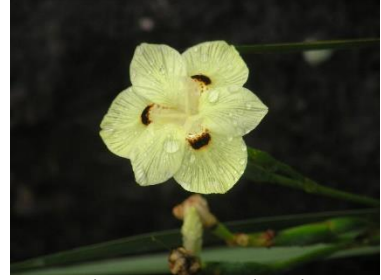
Koko Crater Botanical Garden