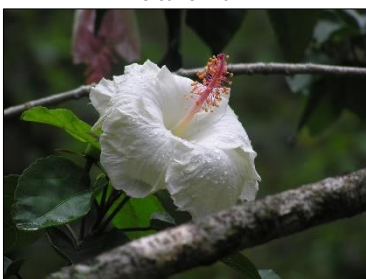
Waimea Valley Walk