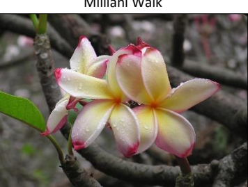
Koko Crater Botanical Garden